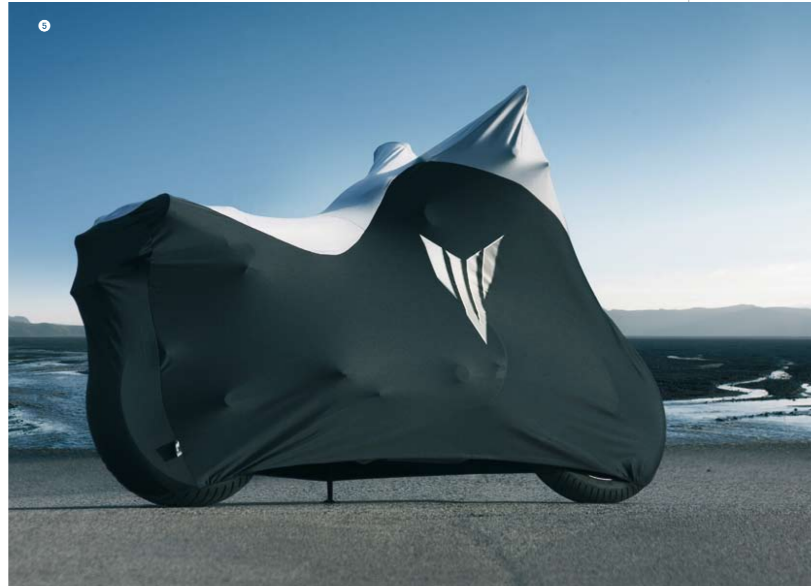
5 MT Performance Indoor Cover YMD-40084-MT-BL