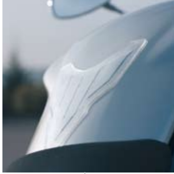
3 MT Resin Tankpad TRANSPARENT WITH SILVER LOGO 5YU-W0740-00-TP BLACK WITH CHROME LOGO 5YU-W0740-10-TP