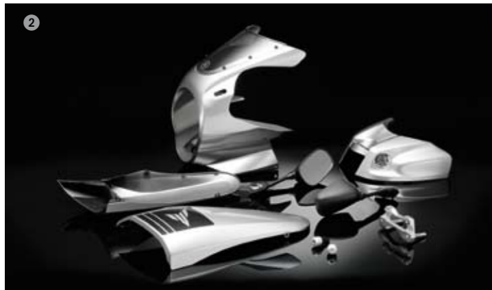
2 Silver Tech (S3) 5YU-W0799-61-00