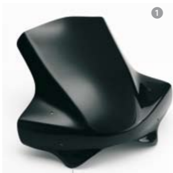
1 Sport Screen TÜV NORD Touring screen for more riding comfort. TÜV-approved. SMOKE 5YU-W0710-50-00 BLACK 5YU-W0710-60-00