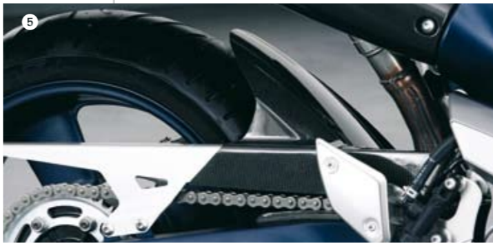
5 Carbon Rear Fender Racing carbon fibre. 5YU-W0708-20-00