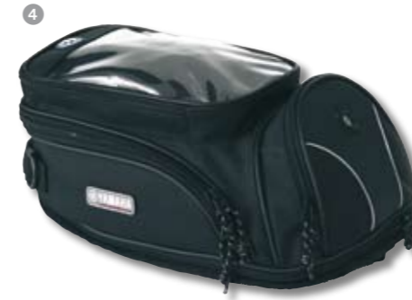
4 TF City Tankbag Soft tankbag with flexible bottom and easy fixation. YMD-20010-95-50