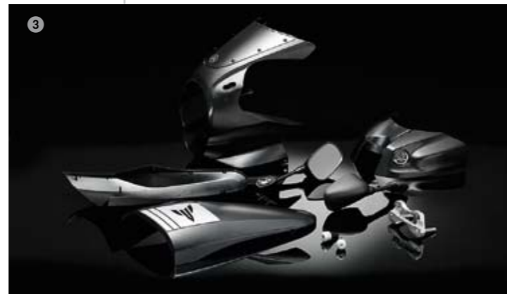
3 Unpainted Kit 5YU-W0799-90-00