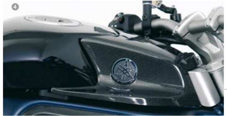
4 Carbon Airbox Cover Racing carbon fibre. 5YU-W0740-15-00 5YU-W0740-10-TP