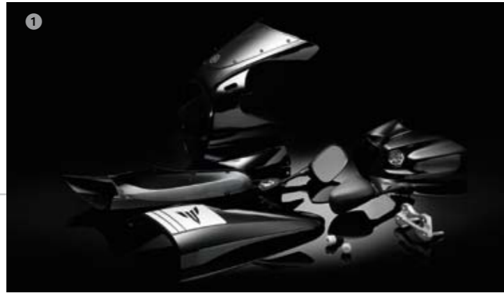
1 Midnight Black (SMX) 5YU-W0799-45-00

Plastic injected headlight cowling providing a retro look and touring comfort to your MT-01. Kit consists of cowling, screen, tank cover, handle bar clamps, mirrors and all necessary stays. Fits all model years.